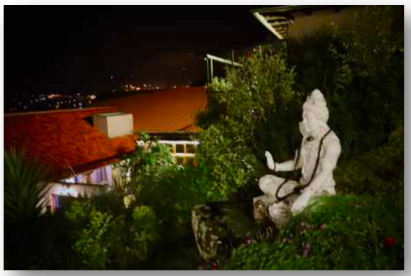
Nighttime at TOSA Blue Mountain...MAGICAL!

The illusions created as part of our world view can bring up fears, doubt and anxieties that are often challenging.