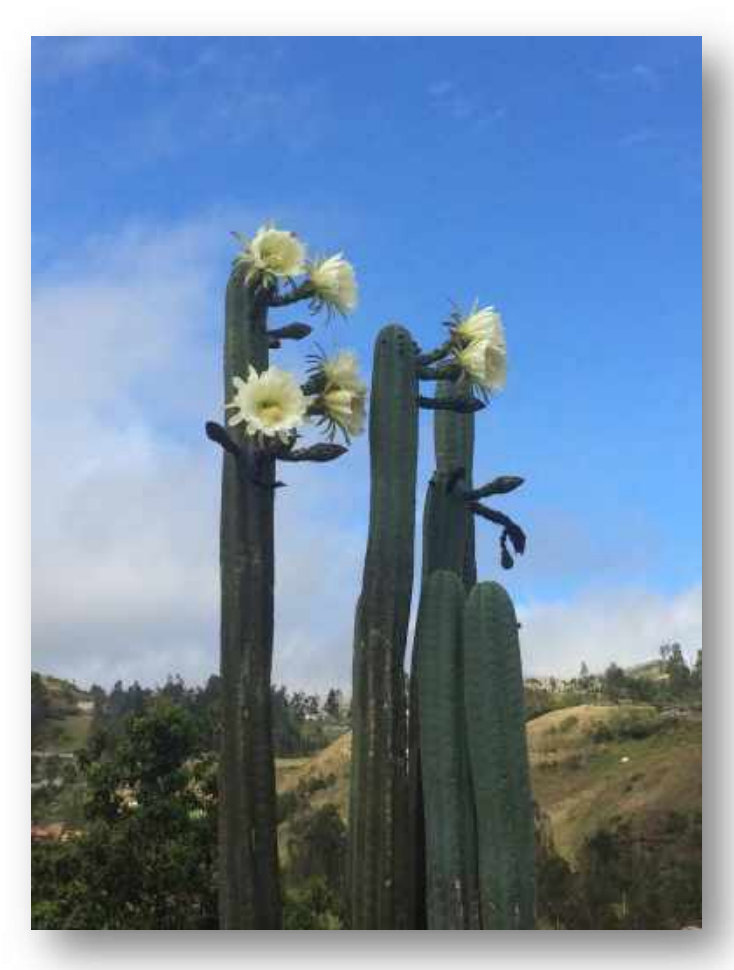
At TOSA Blue Mountain Sanctuary we have been called to carefully and lovingly plant and cultivate the San Pedro for your journey onsite! You might even participate in the harvest!

Onsite cultivation and preparation assure organically grown cactus in divine harmony with higher frequencies.